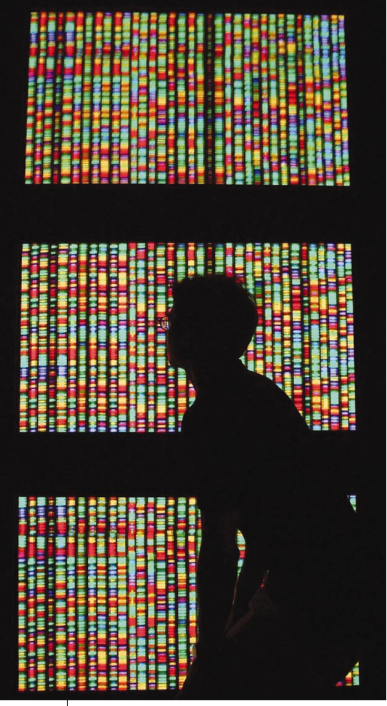
Admirable sight: an observer studies the human genome sequence.

Many of the milestones along the epic journey to sequencing the human genome first came to light in the headlines of newspapers and on television. Rivals from different camps would compete for the bigger